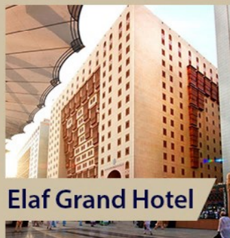
Elaf Grand Hotel