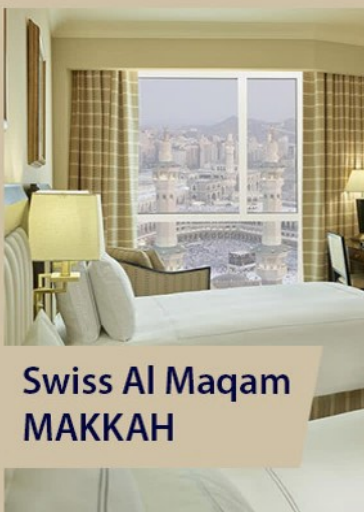
Swiss Al Maqam MAKKAH