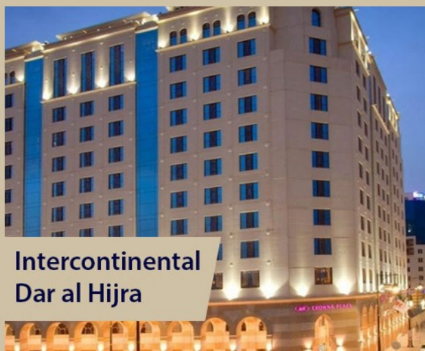
Intercontinental Dar al Hijra