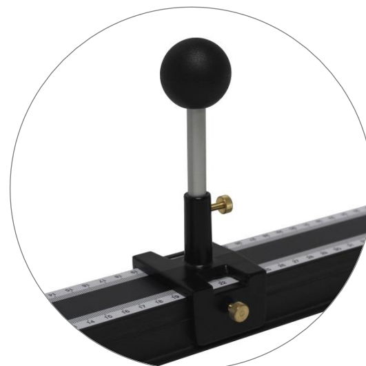
Ball on rod on SENIOR optics bench