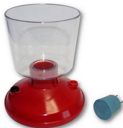
Electrolyser with cap with platinum electrodes