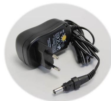
Included power supply

Black aluminium casing with hexagonal shape Aluminium rod \varnothing 10 removable Lighting source: LED 3W Condenser: 2 lenses \varnothing 40 F+100 Ventilated Power supply included Longitudinal adjustment rod Weight: 330 g Dimensions with rod: 225 x 95 x 220 mm Packaging: individual box.