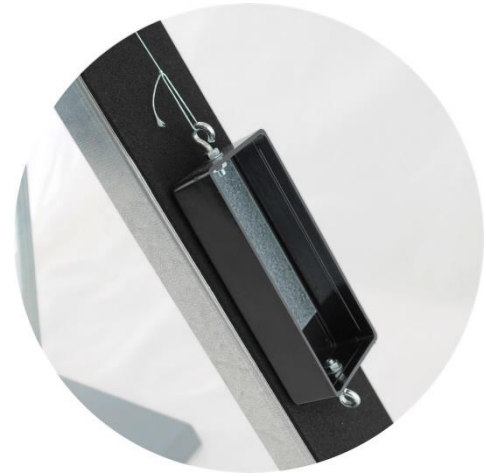
Pulley, protractor with plumb line and trolley with two hooks