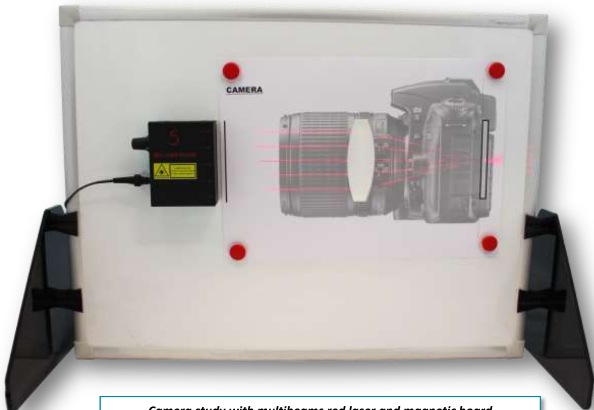
Camera study with multibeams red laser and magnetic board