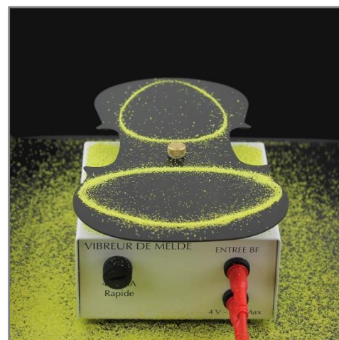
CHLADNI experiment with square and violin slabs