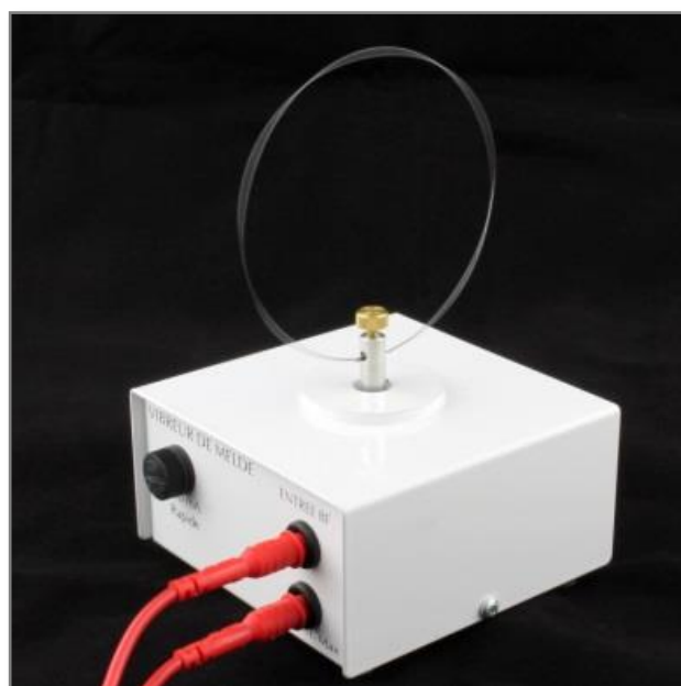
MELDE experiment with circular MELDE rope