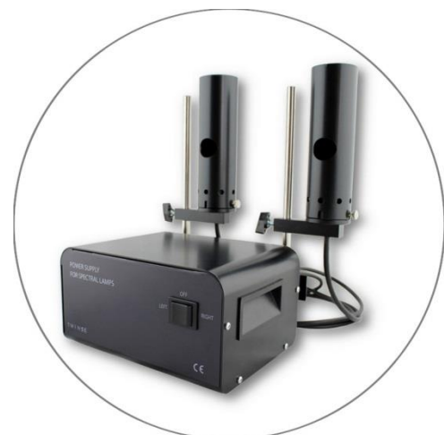
Power supply with two carters